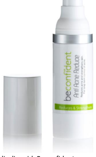
salicylic acid, Beconfidents

products act with ingredients that will not dry out the skin or give other uncomfortable side effects.